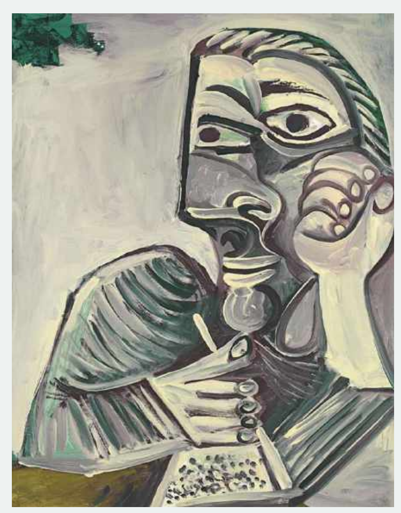
Picasso, self-portrait, 1966